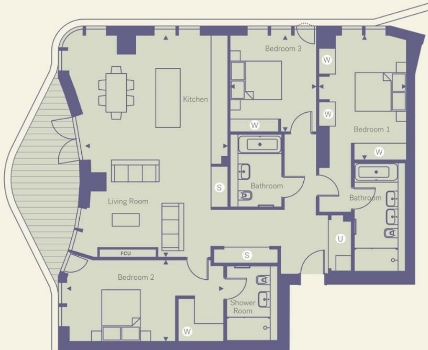
UNIT FLOOR PLAN - W.207